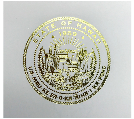
*Zoomed in image of small gold foil State seal