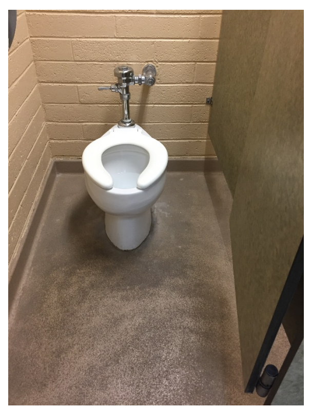
Typical restroom stall. Floor tiles only, no wall base. Concrete curb to remain. Contractor to touch up paint on concrete curb.