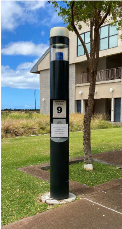
Photo of 1 of 16 Code Blue ECB Towers

All ECB towers have had datajacks installed to accommodate new cameras